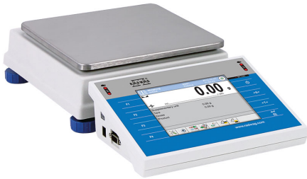
WLY 20/D2 Precision Balance

More information on the website radwag.com/en/info,w1,V4N