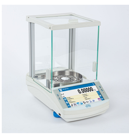
AS 60/220.X7 Analytical Balance

The drawings, photos and graphics used are for illustrative purposes only.