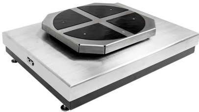
HRP 1000.1.5Y.KO Mass Comparator

More information on the website radwag.com/en/info,w1,MPU