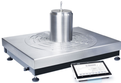
HRP 1000.5Y.KO.Q Mass Comparator

More information on the website radwag.com/en/info,w1,2RI