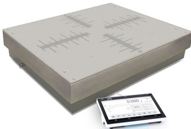
HRP 2000.5Y.KO Mass Comparator

More information on the website radwag.com/en/info,w1,ZE3