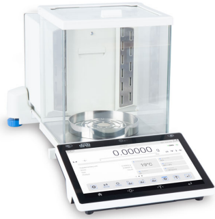
XA 200.5Y.KO Mass Comparator

The drawings, photos and graphics used are for illustrative purposes only.