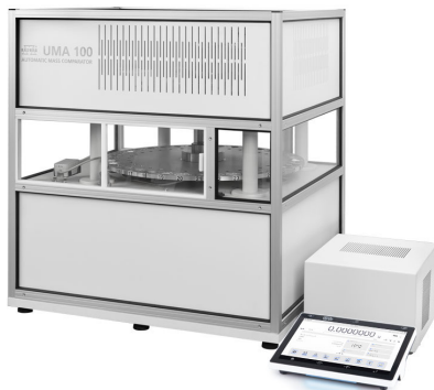
UMA 200.5Y Automatic Mass Comparator

The drawings, photos and graphics used are for illustrative purposes only.